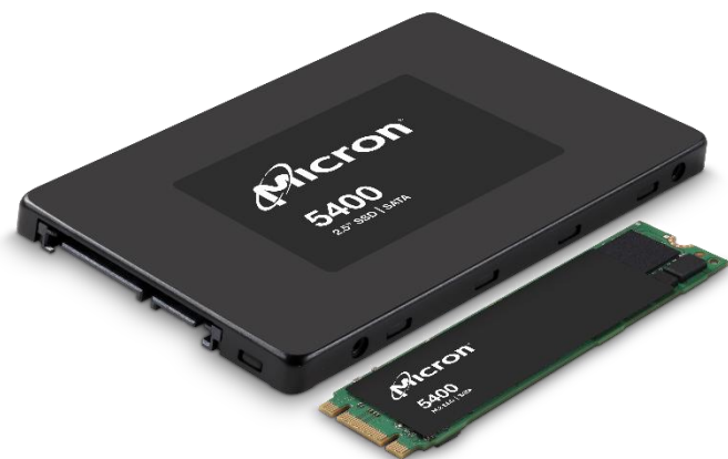
Micron 5400 SSD

Additional firmware-based security options like TCG Enterprise and TCG Opal combine with integrated, hardware-based AES 256-bit encryption for full performance plus extra security and peace of mind. 5