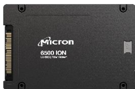
Micron 6500 ION 30.72TB SSD Available in U.3 (15mm) and E1.L (9.5mm)

For data centers that need to affordably scale storage density, the Micron 6500 ION is the answer.