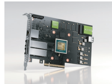
BlueField-3 DPU – 2x 200Gb/s FHHL form factor